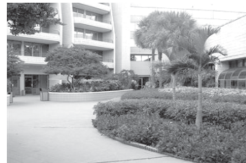
Crowne Plaza Tampa East